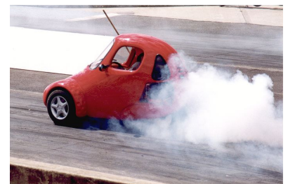
"The company was founded at the track"

For more information please go to http://www.alltraxinc.com